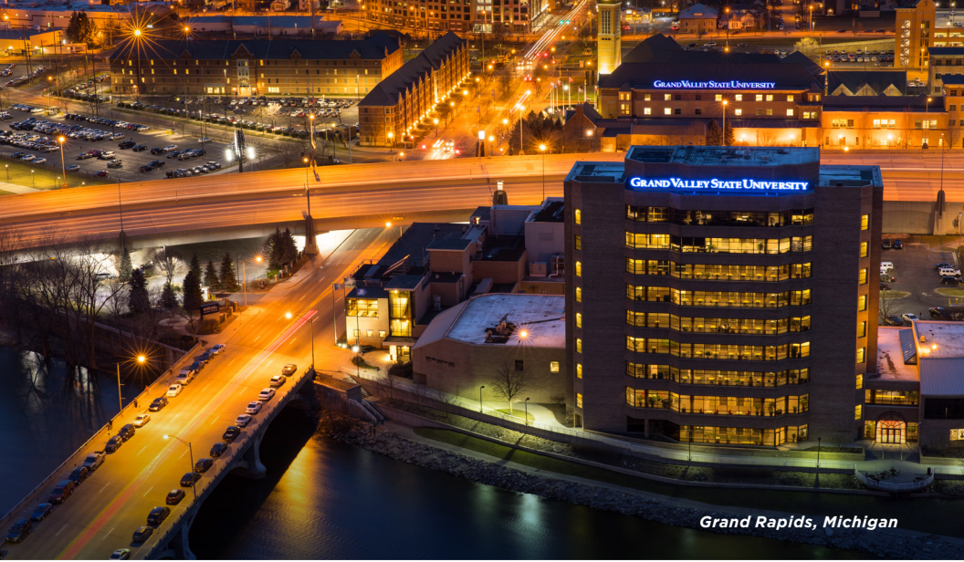
Grand Rapids, Michigan