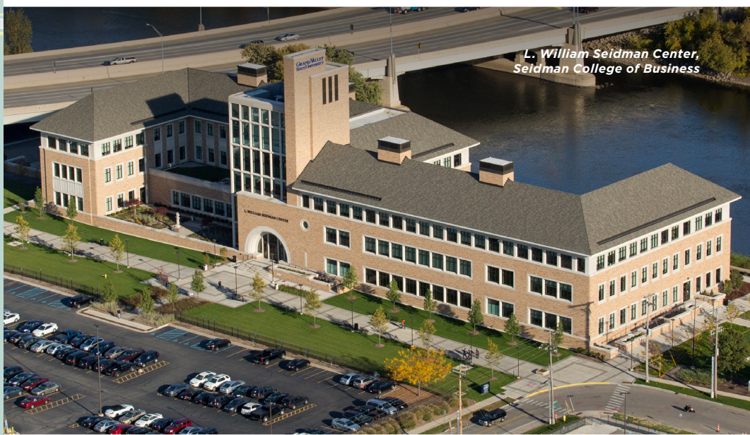
L. William Seidman Center, Seidman College of Business