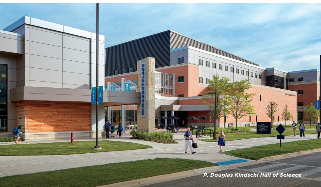
P. Douglas Kindschi Hall of Science