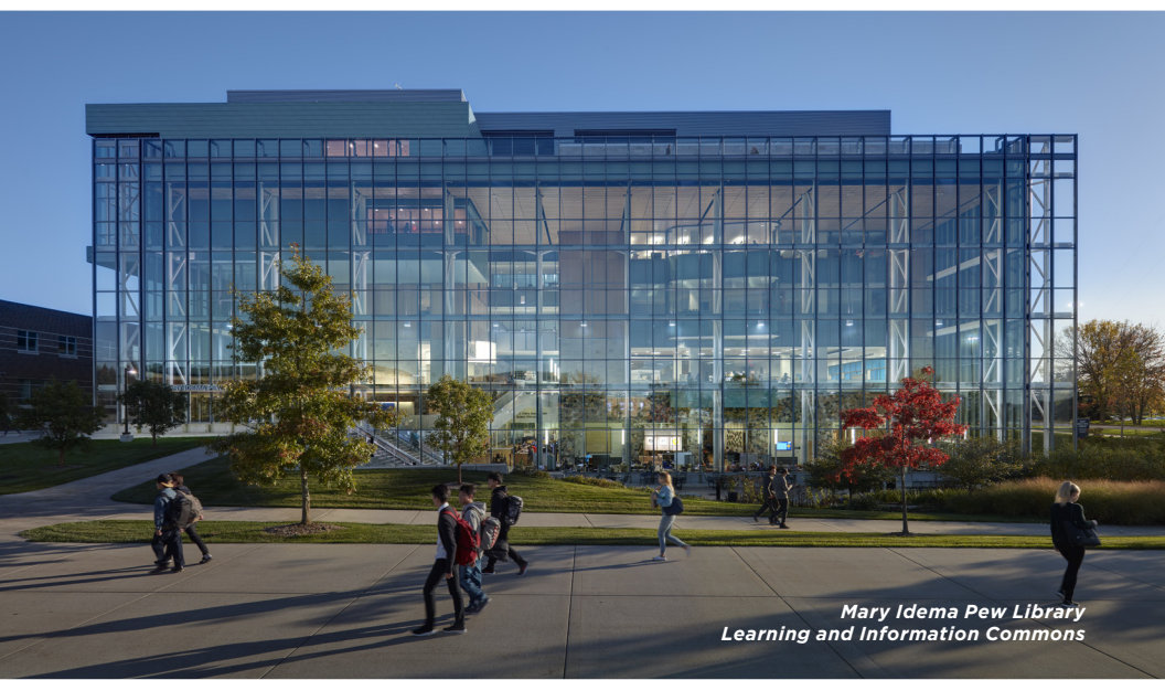
Mary Idema Pew Library Learning and Information Commons