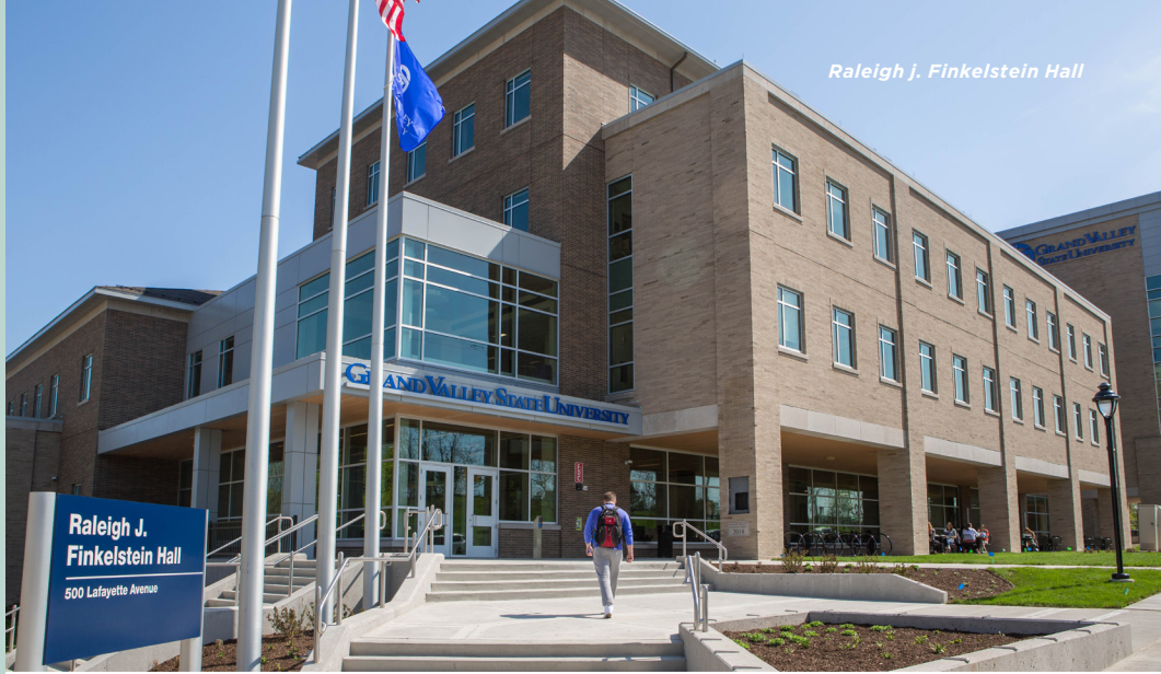
Raleigh J. Finkelstein Hall