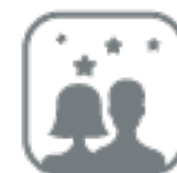
Family and Friends Weekend