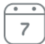
October's Freak, Winter, and Spring Week!