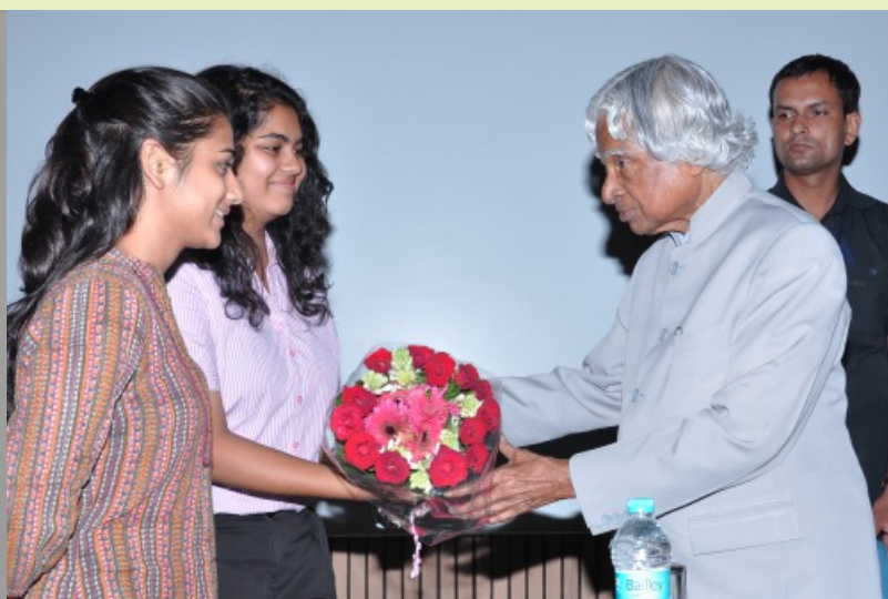
IPM students greet former President of India Dr. A P J Abdul Kalam