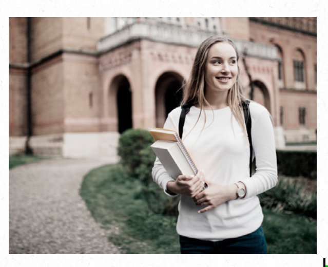
*Accredited by EQUIS.

DeakinTALENT is Deakin's award-winning careers and employment service. Students and graduates can access programs and services that empower them to explore a broad range of career opportunities, build skills and experience that help them shape their careers to align with their interests, values and competencies.