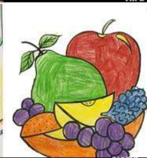
OJASVI PRE-SCHOOL C