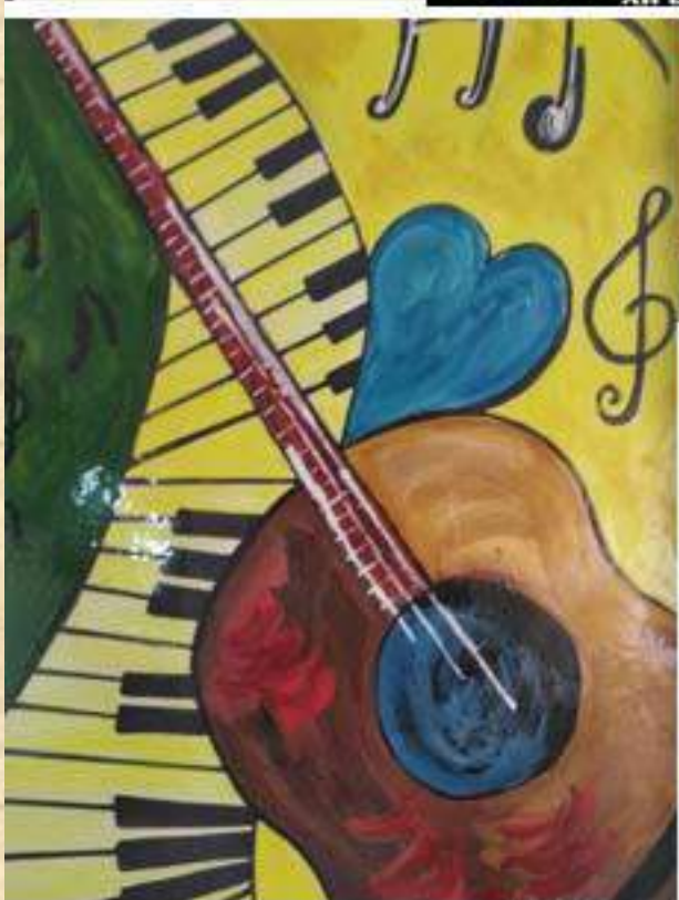
JULIE VIII E