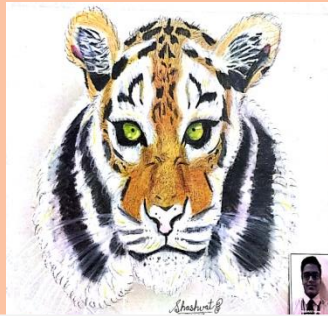
SHASHWAT – IX A