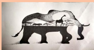
ANUSHKA SINGHAL- X