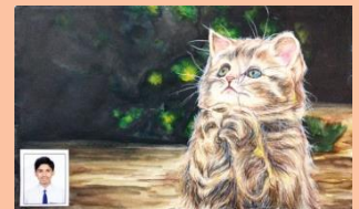
KESHAV SAINI- X F