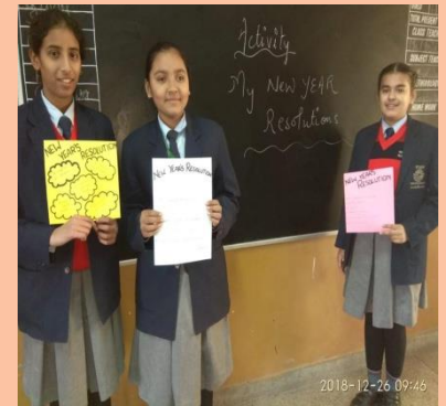
NEW YEAR RESOLUTION