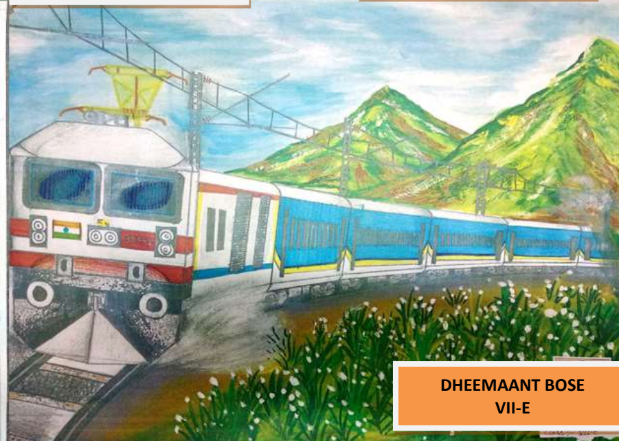
DHEEMAANT BOSE VII-E

Stay updated with the latest happenings at Ryan, Ghaziabad