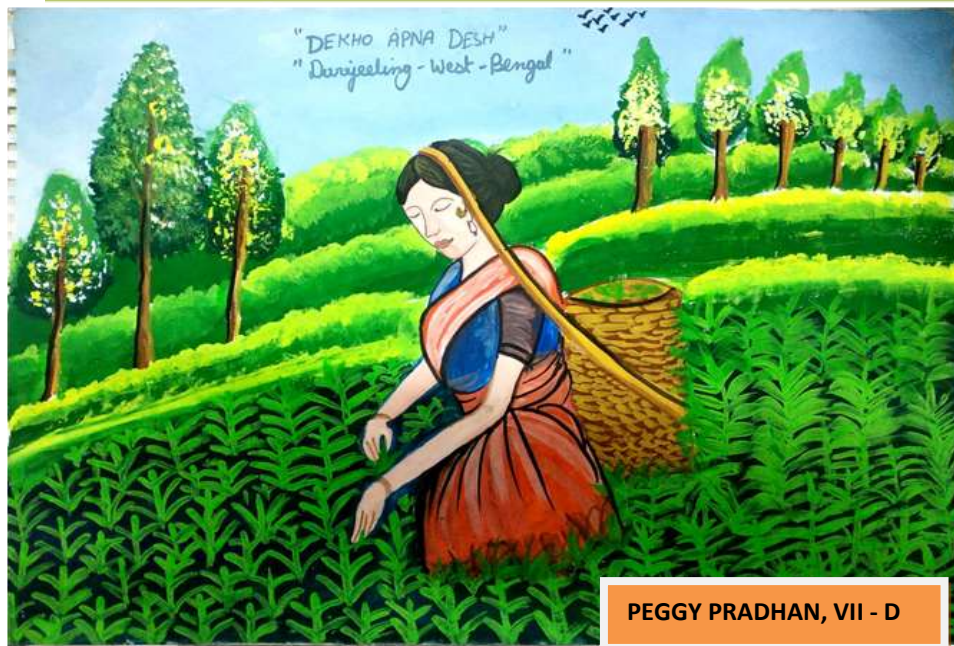
PEGGY PRADHAN, VII - D