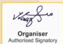
Organiser Authorised Signatory