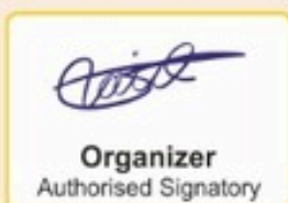
Organizer Authorised Signatory