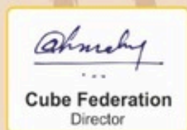
Cube Federation Director

held online on 19 Feb, 2022 - 20 Feb, 2022.