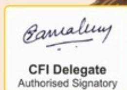
CFI Delegate Authorised Signatory